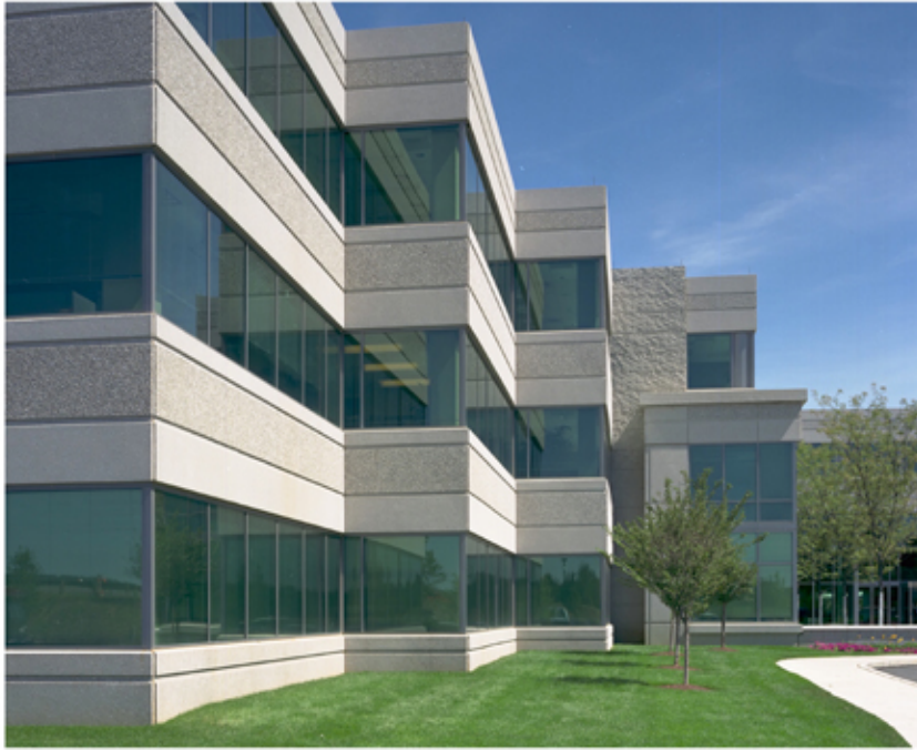
Insulated Precast Concrete Panels