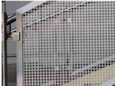
Woven Aluminum Mesh (Balconies, Terrace & Garage)