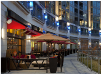
Insulated Precast Concrete Panels