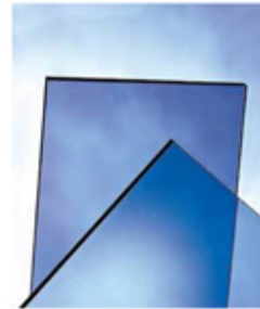
Blue-Gray Tinted Low-E Glass