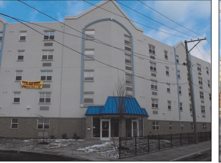
Haven Peniel Senior Homes