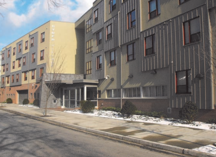
Mt. Tabor Cyber Village

These projects above received approximately $4 million from the City of Philadelphia, providing affordable housing for senior residents. Pictured above left is Haven Peniel located at 23rd & Turner in North Philadelphia. For more information call 215.787.0400. Above right is Mt. Tabor Cyber Village located at 7th and Girard also in North Philadelphia. For more information call 215.625.0902.