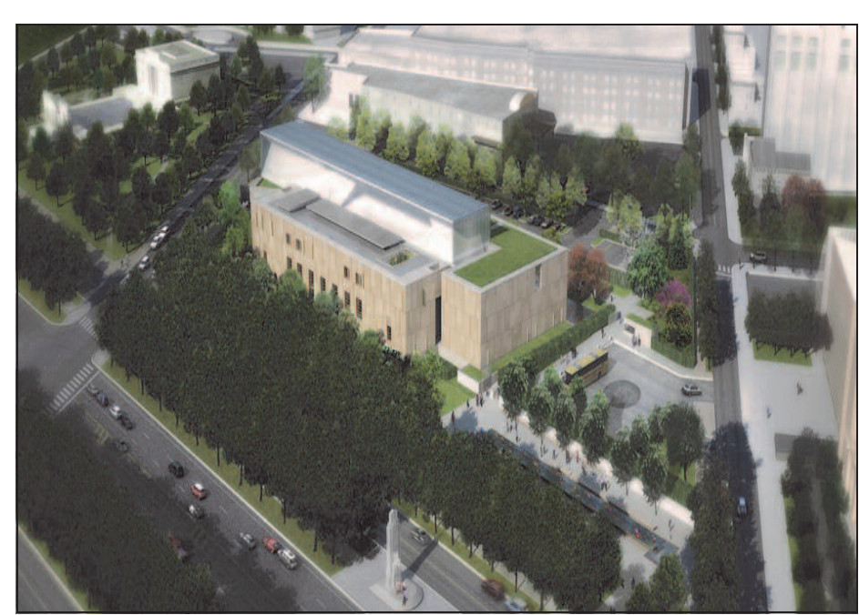
Northwestern aerial view of the Barnes Foundation from the Ben Franklin Parkway.