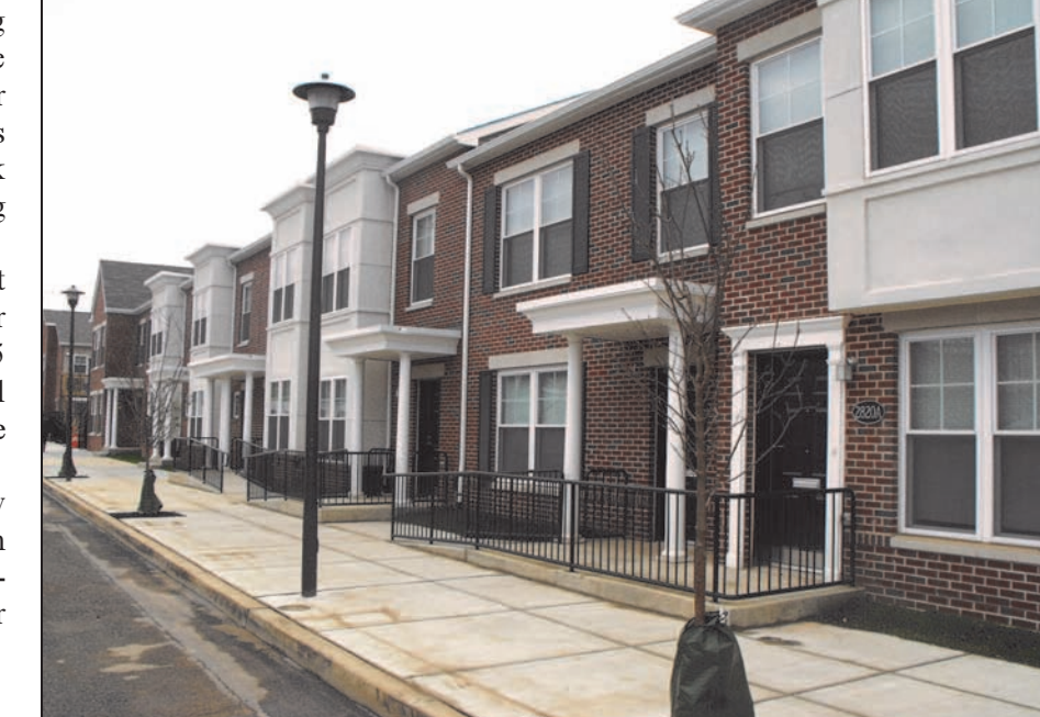
Pictured is Phase I of the Warnock Village mixed use development.

The ribbon cutting was recently held for Phase I of Warnock Village, which features multiple units with central air, carpeting, modern kitchens and Energy Star appliances.