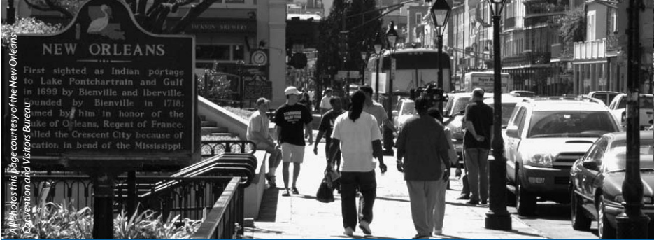
All photos this page courtesy of the New Orleans Convention and Visitors Bureau.