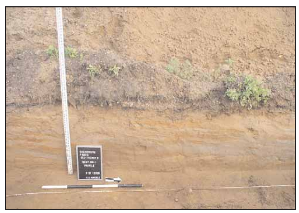
Photograph 36: Shot of west wall profile GeoTrench 8 78-86 feet showing modern fill over modern alluvium (banded sands) over Pleistocene-aged soil with cobbles. View facing west (May 2008).