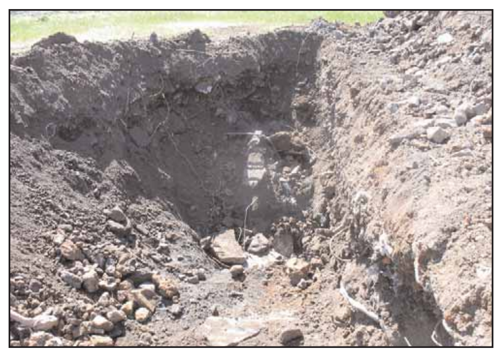
Photograph 67: Shot of excavated SRT-4 showing demolition rubble and concrete footers. View facing north (May 2008).