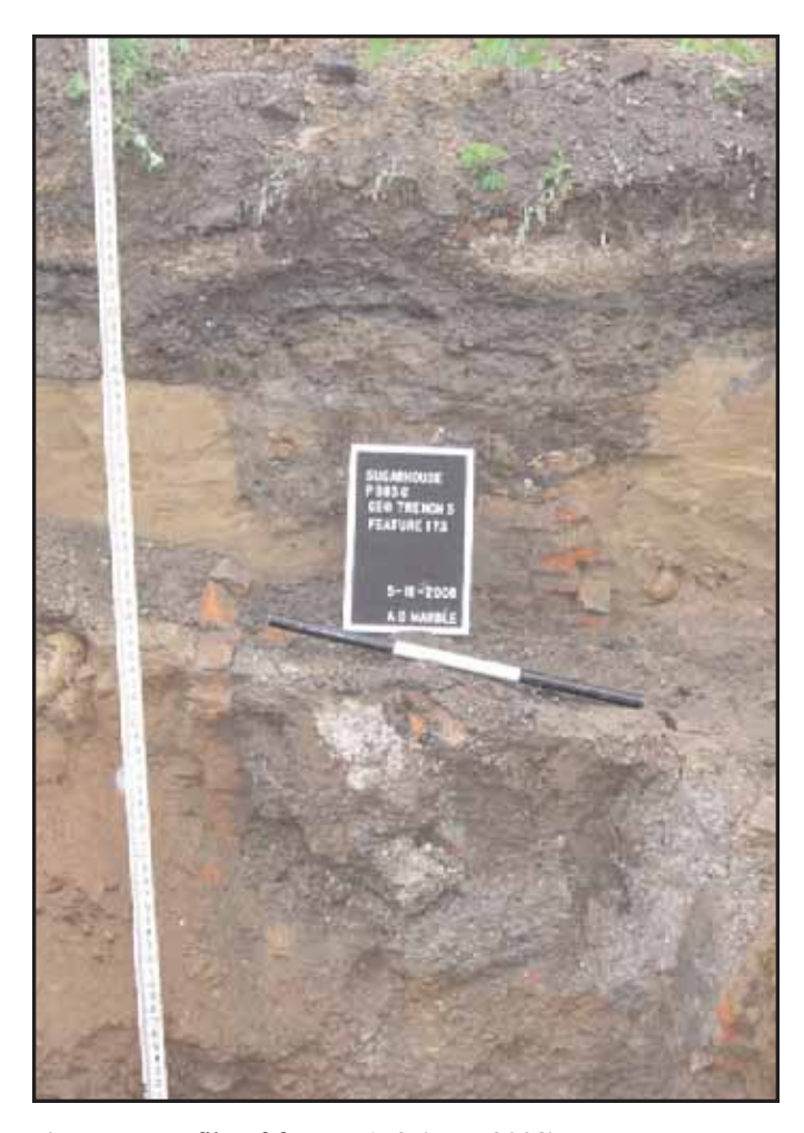
Photograph 47: West profile of feature 173 (May 2008).