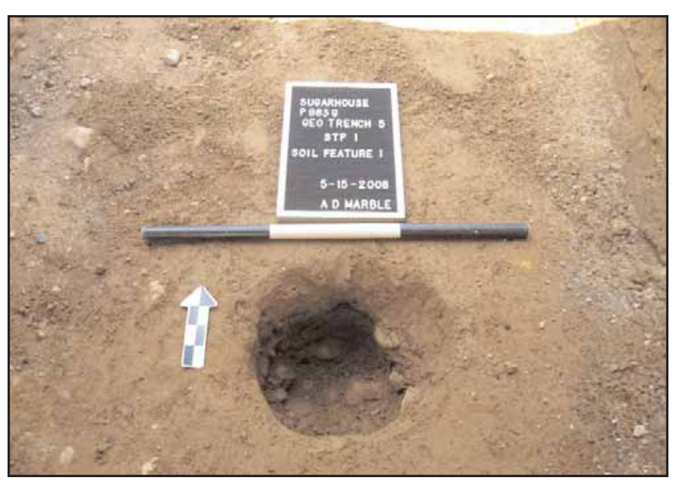
Photograph 20: View of shovel test excavated into Feature 186 (May 2008).