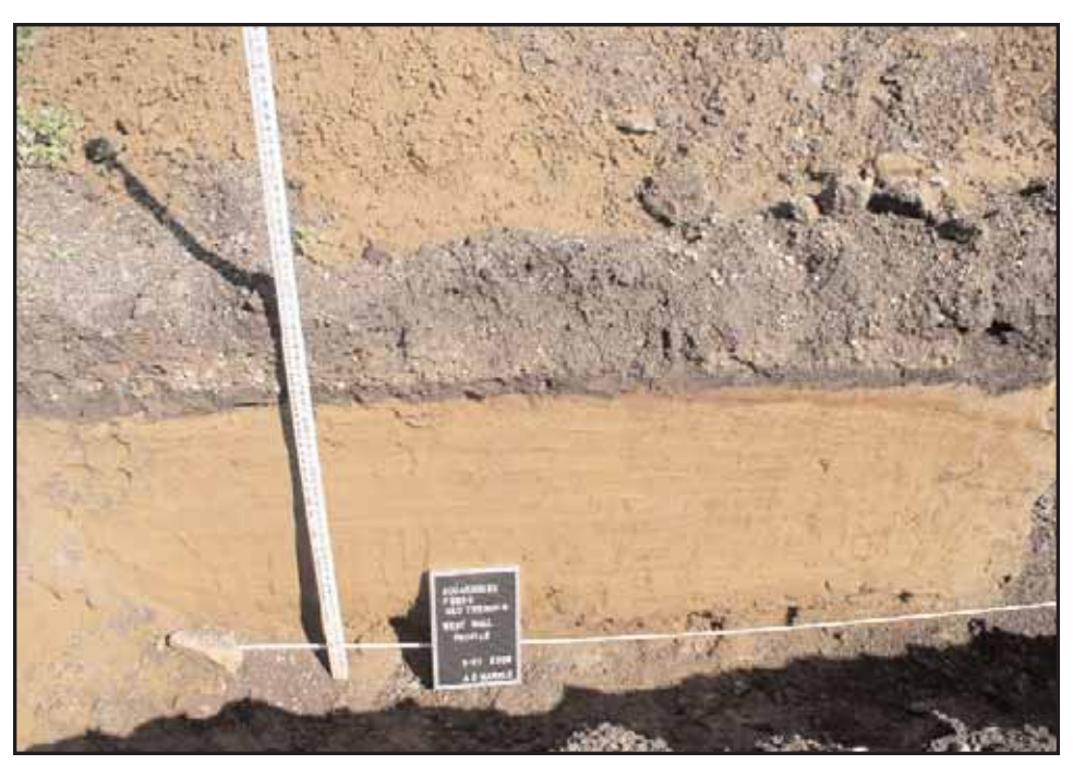
Photograph 40: Shot of west wall profile GeoTrench 9 2-9 feet showing modern fill over modern alluvium (banded sands) over Pleistocene-aged soil with cobbles. View facing west (May 2008).