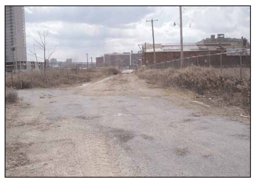
Photograph 2: Remains of the intersection of Laurel Street and Penn Street, looking south (March 2007).