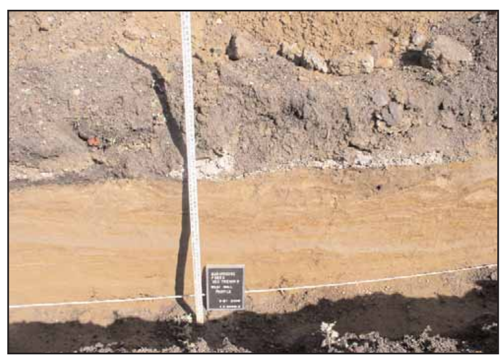
Photograph 41: Shot of west wall profile GeoTrench 9 24-34 feet showing modern fill over modern alluvium (banded sands) over Pleistocene-aged soil with cobbles. View facing west (May 2008).