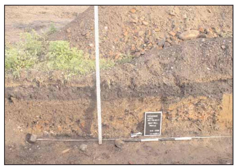
Photograph 34: Shot of west wall profile GeoTrench 8 0-12 feet showing fills associated with Feature 175 beneath modern fill. View facing west (May 2008).