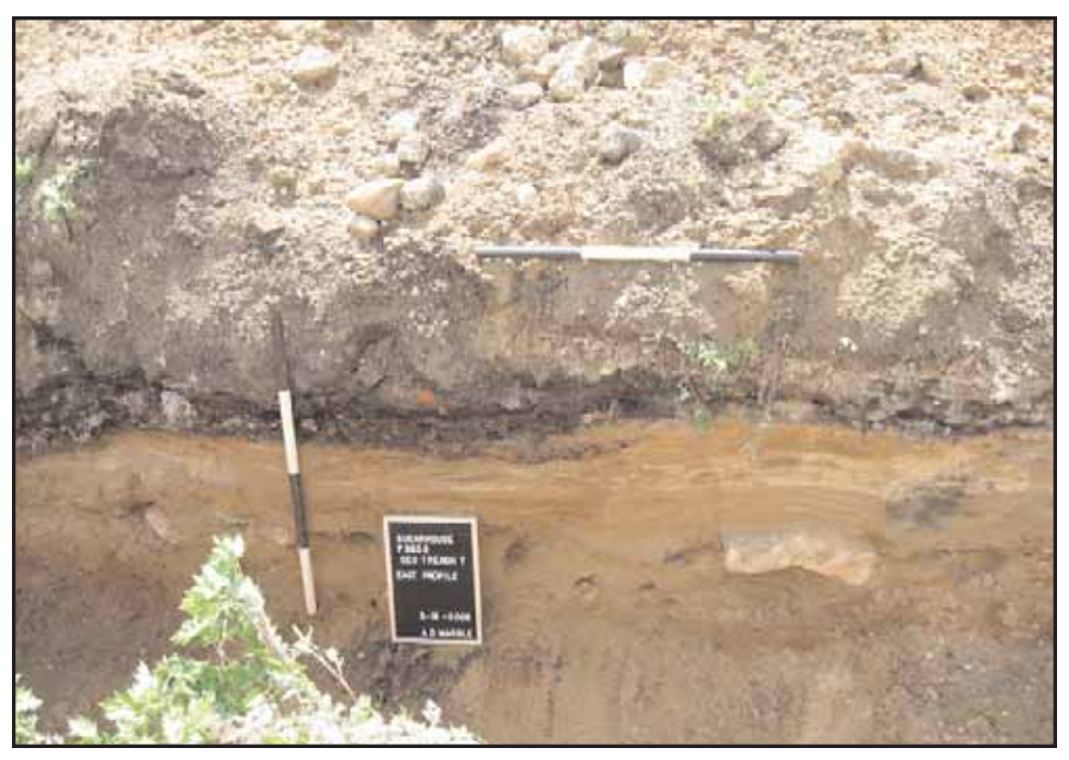
Photograph 29: Shot of east wall profile GeoTrench 7 86-94 feet showing modern fill horizons over modern alluvium (banded sands) over Pleistocene-aged soils with cobbles. View facing east (May 2008).