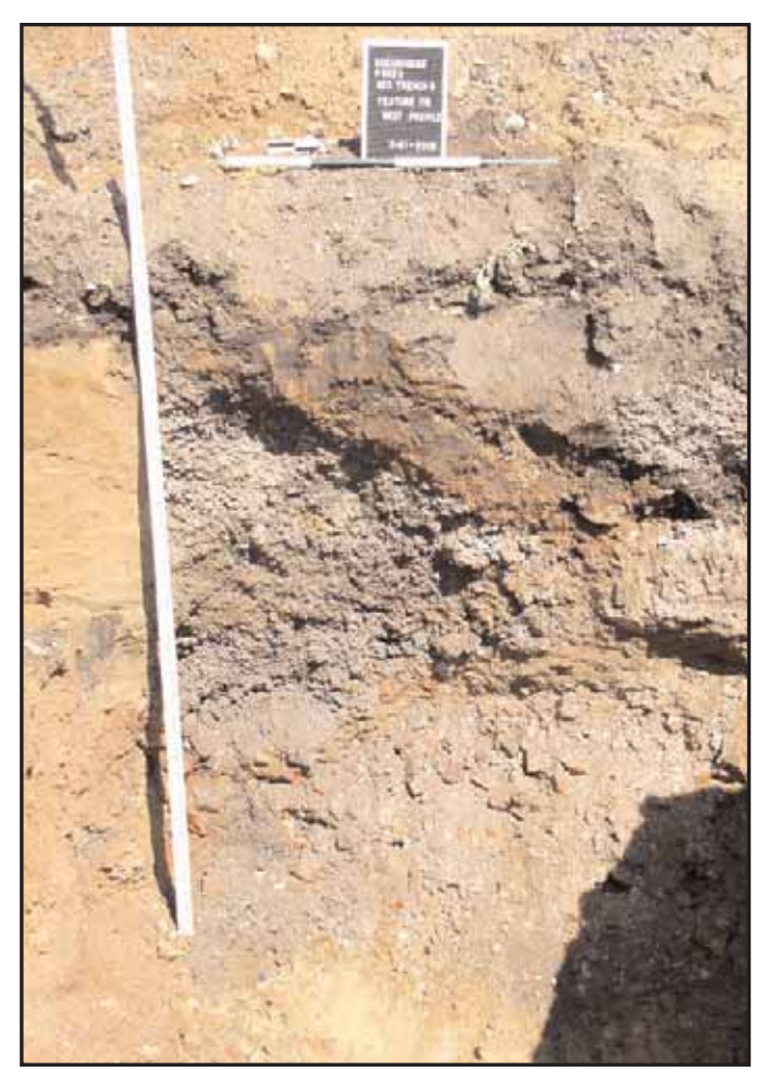
Photograph 51: Profile shot of Feature 176, a brick-lined shaft feature showing fill from top to bottom in Historic Area H-2. View facing west (May 2008).