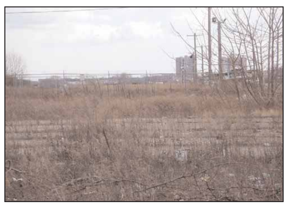
Photograph 4: Southern portion of APE, looking east toward Penn Street and the river (March 2007).