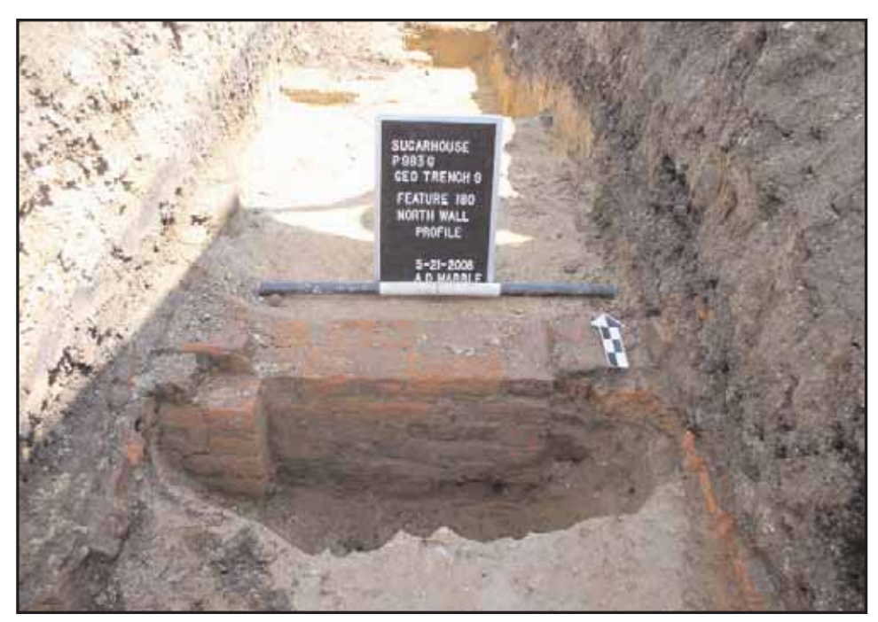
Photograph 60: Profile shot of Feature 180 showing the courses of brick comprising the north wall (May 2008).