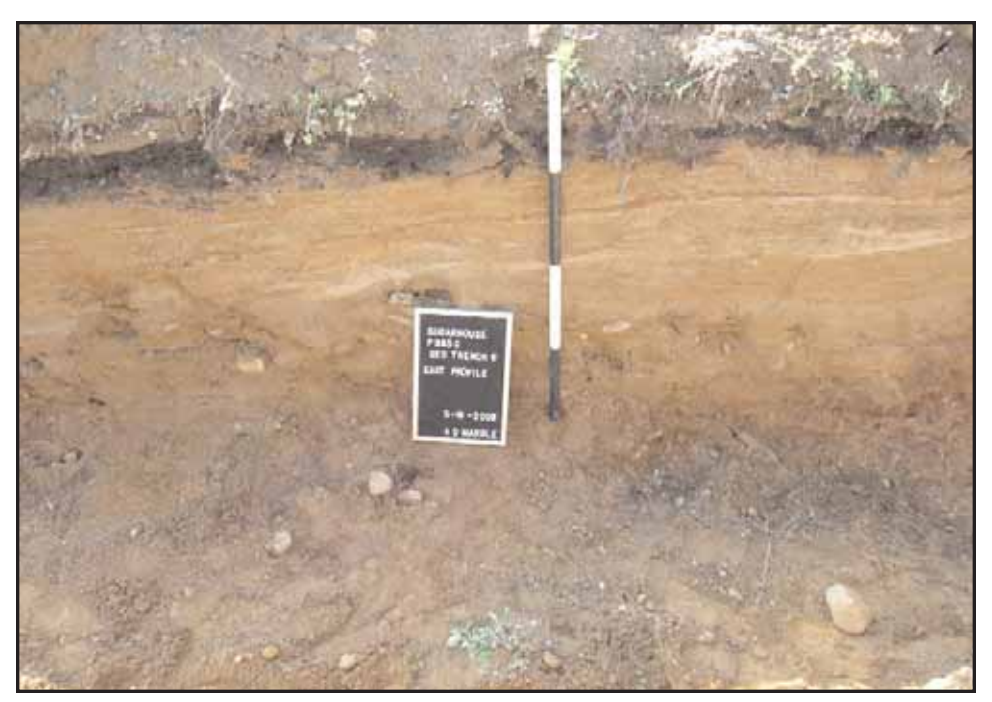
Photograph 24: Shot of east wall profile GeoTrench 6, 99-108 feet showing fill horizons over modern alluvium (banded sands) over Pleistocene-aged soils with cobbles. View facing east (May 2008).