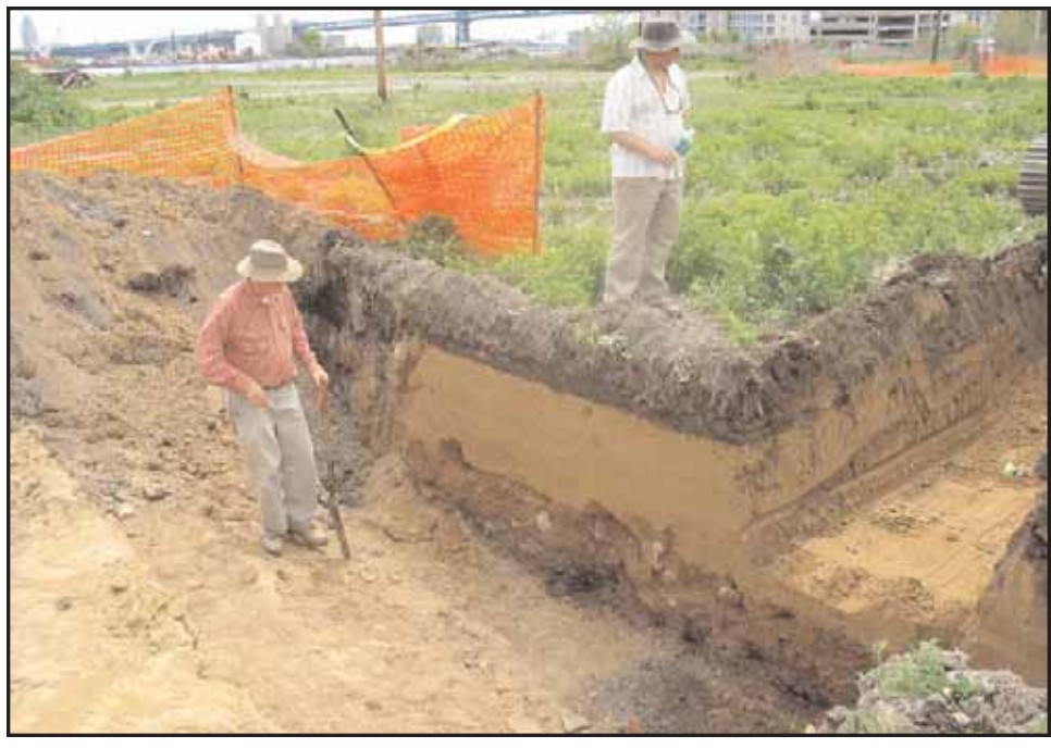
Photograph 8: View to the east showing geomorphological examination in Geo-Trench 3 (May 2008).