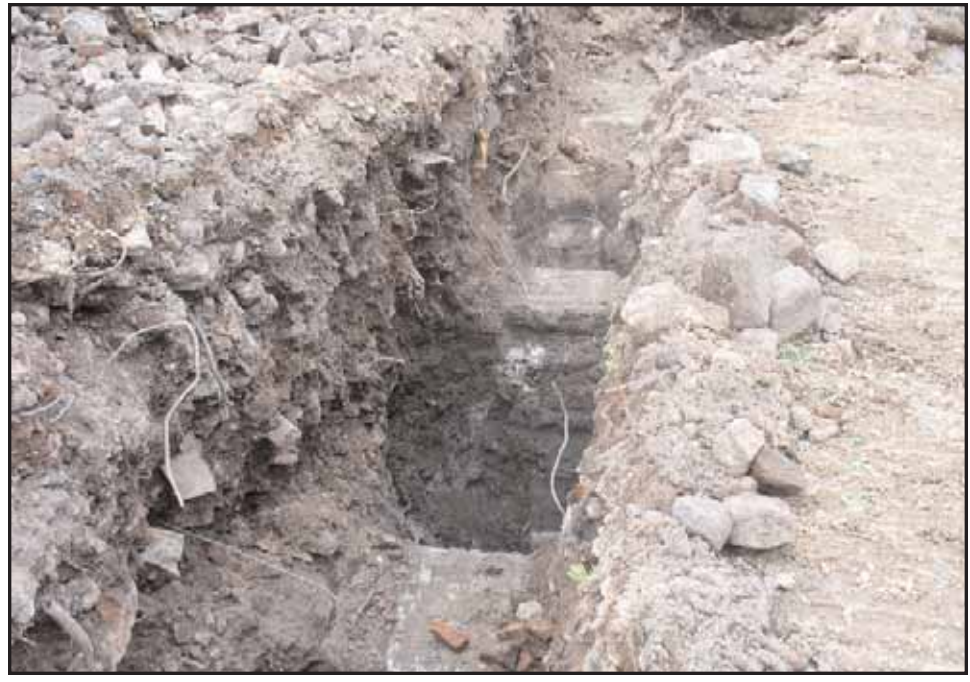
Photograph 68: Excavation shot of SRT-5 showing concrete floor, brick foundation/footer, utility pipe, and deep riverine soils. View facing west (May 2008).