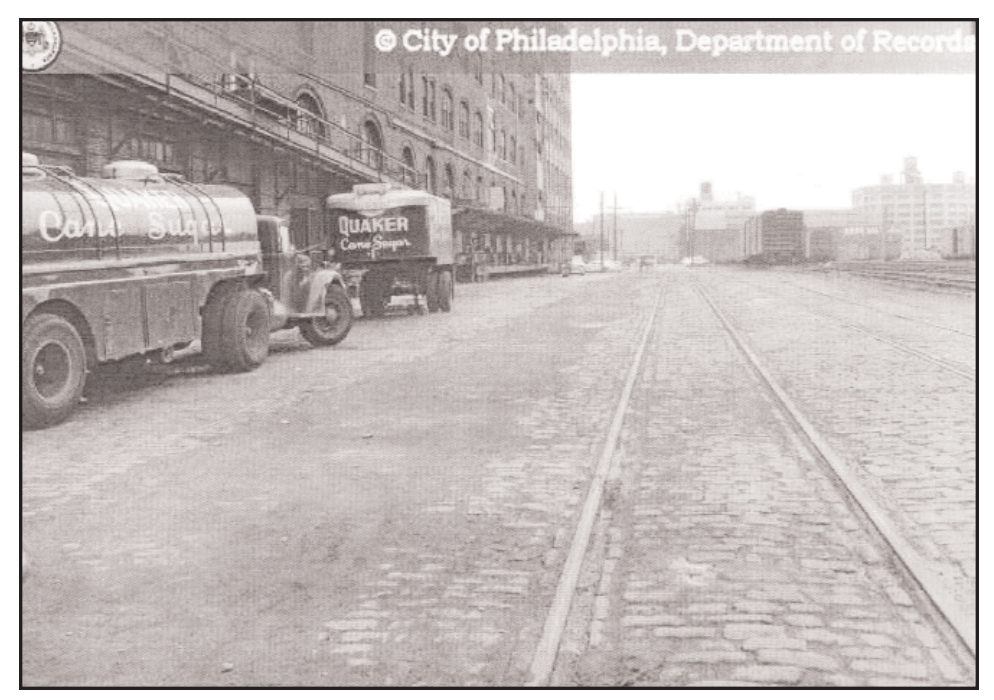
Photograph 5: View down Penn Street showing the Pennsylvania Sugar Refinery on the left (July 1956).