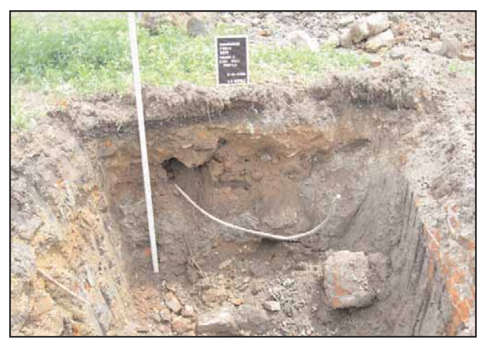
Photograph 14: Shot of east wall profile of Beach Street Power Station Trench 4 showing demolition fill and the remains of a brick foundation wall, right side of photograph, in Historic Area H-1. View facing east (May 2008).