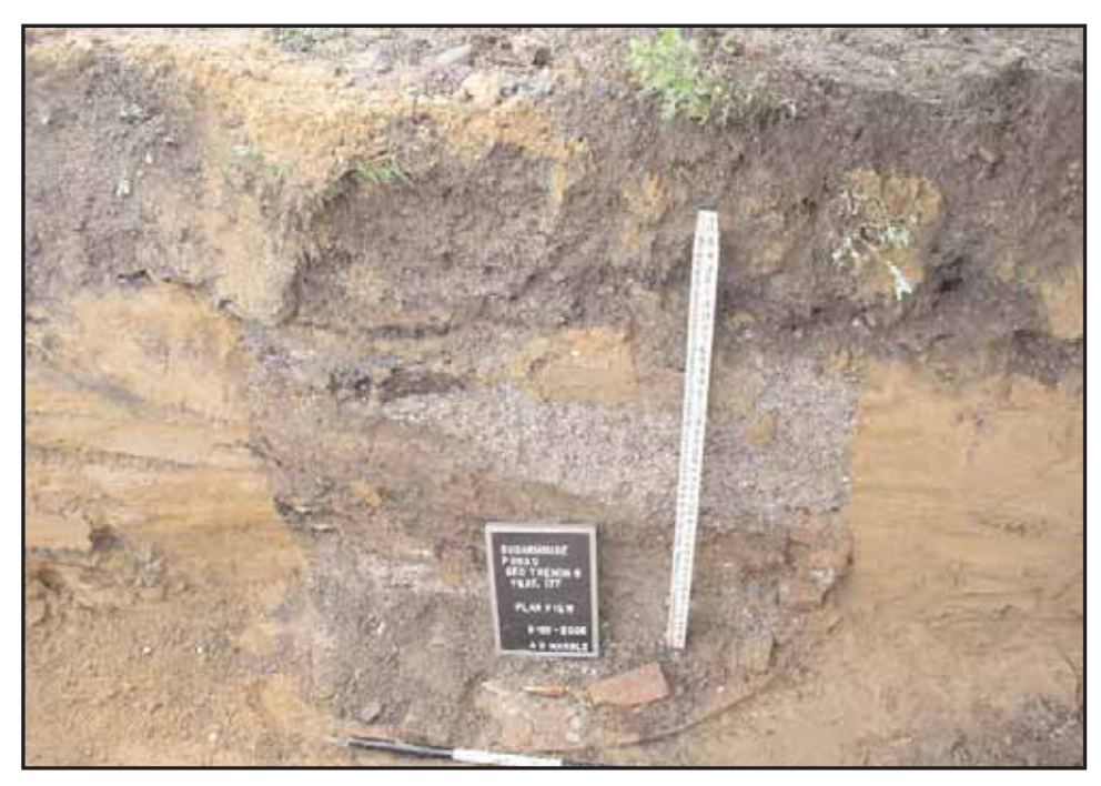
Photograph 52: Planview shot of circular brick-lined Feature 177 in Historic Area H-2. View facing west (May 2008).