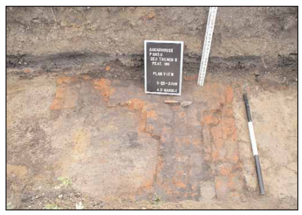
Photograph 59: Planview shot of the remains of Feature 180, two multi-course walls separated by a single course of brick (May 2008).