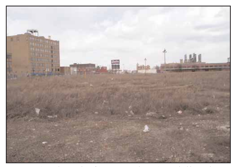
Photograph 1: Northern portion of APE near N. Delaware Avenue, looking north (March 2007).