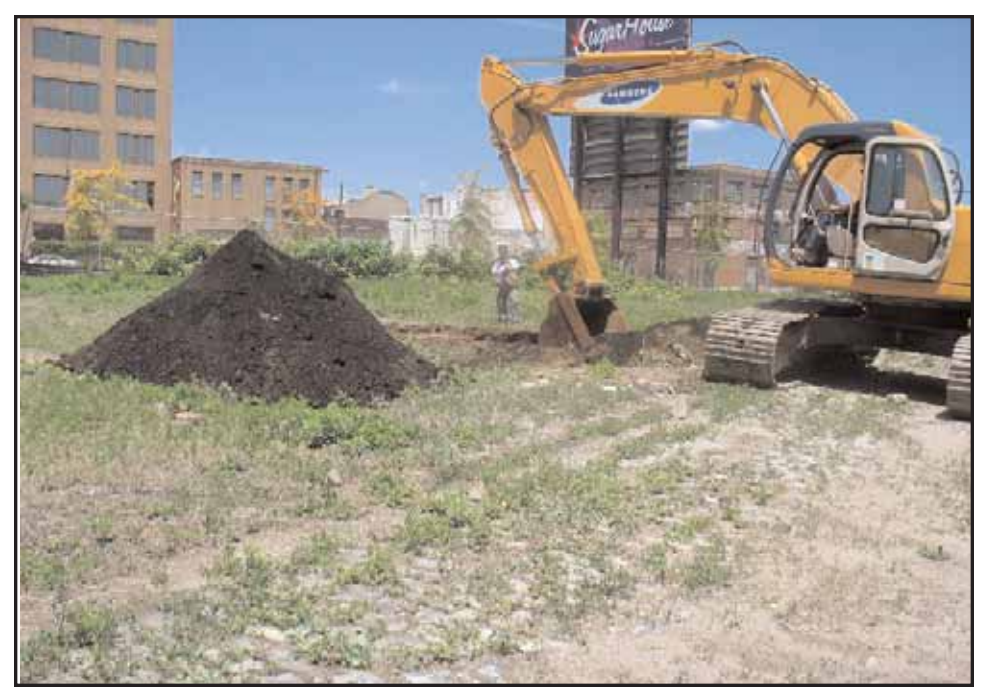
Photograph 7: View to the northwest showing monitoring of GeoTrench 4 (May 2008).