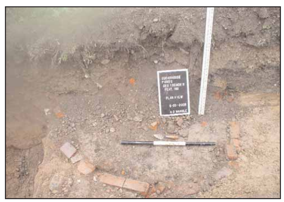
Photograph 57: Planview shot of Feature 182, a circular brick-lined shaft. View facing east (May 2008).