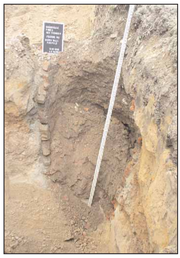
Photograph 58: Profile shot of Feature 182 showing mechanically bisected shaft and collapsed fill. View facing northeast (May 2008).