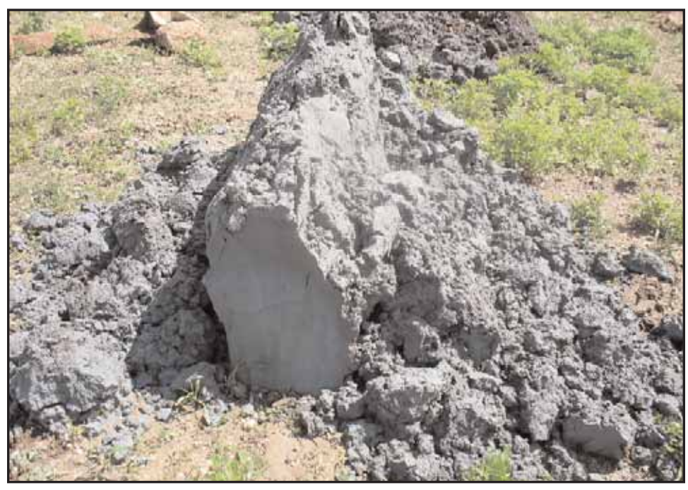
Photograph 65: An example of the gley-colored, riverine soils reached at 12 feet below surface in SRT-2 (May 2008).