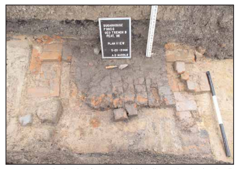
Photograph 61: Planview shot of Feature 181, a brick walkway and north and south wall. View facing west (May 2008).