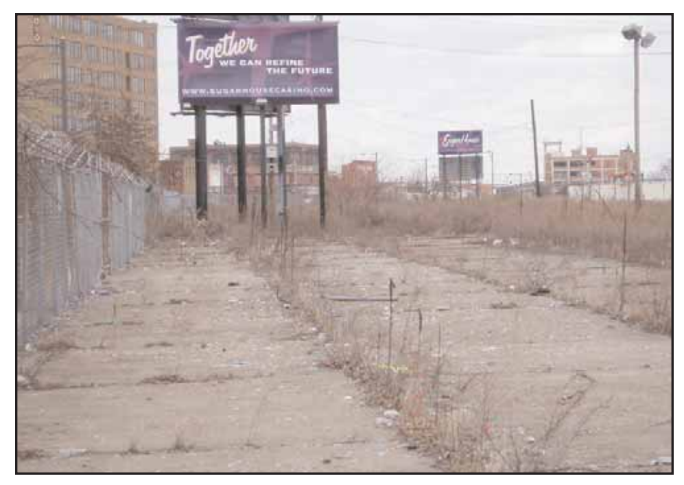
Photograph 3: Cement pads in southern portion of APE near N. Delaware Avenue, looking north (March 2007).