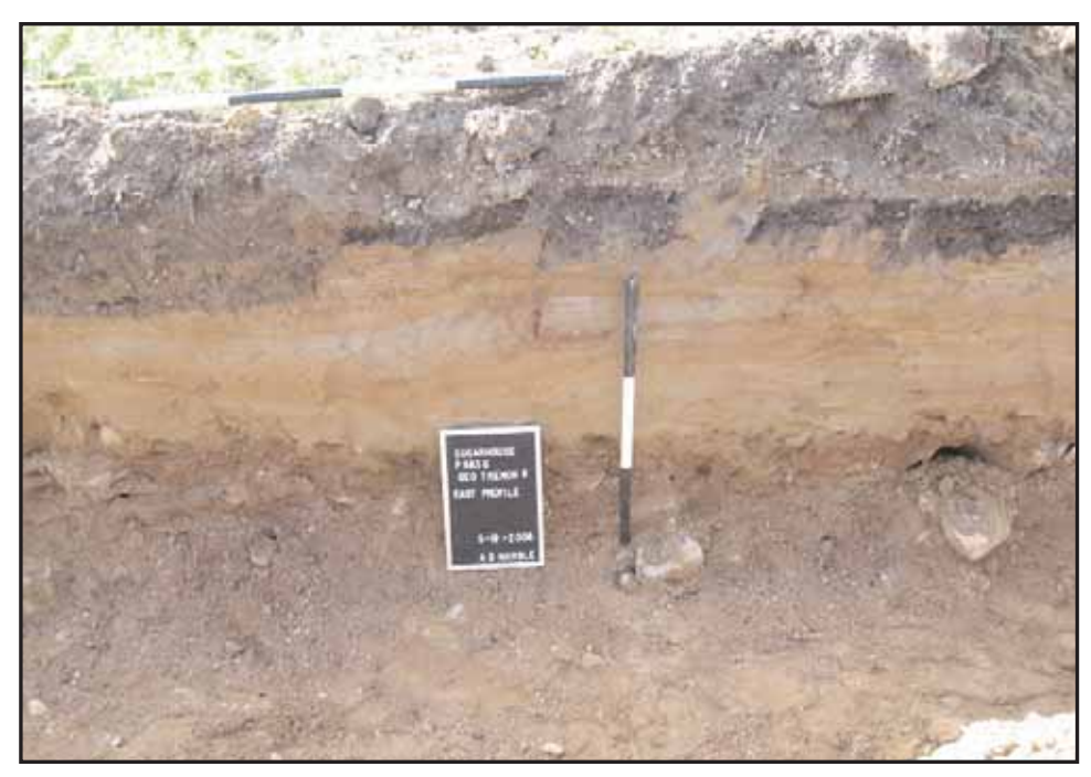
Photograph 23: Shot of east wall profile GeoTrench 6 54-62 feet showing modern alluvium (banded sand) overlying Pleistocene soil with cobbles. View facing east (May 2008).