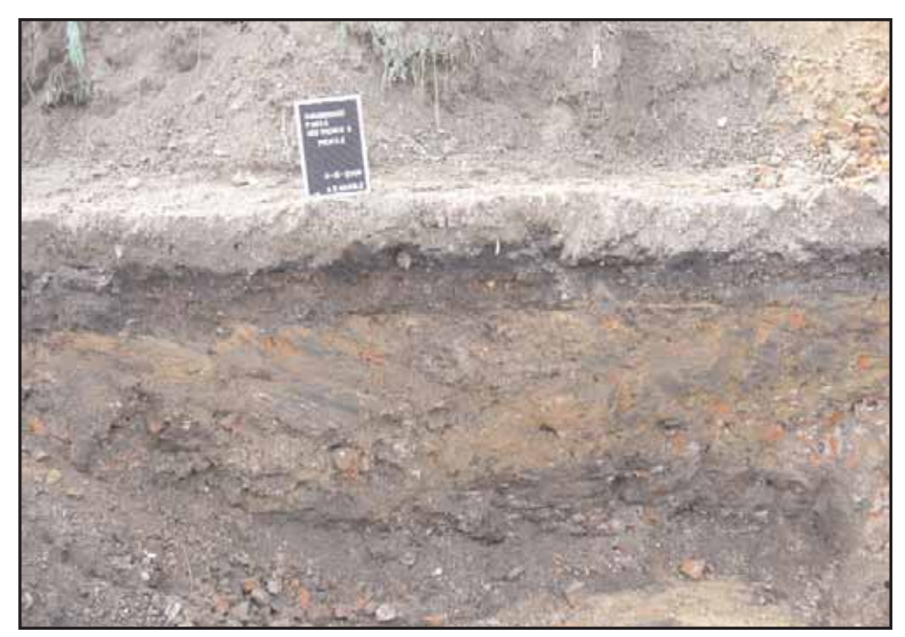
Photograph 18: Shot of east wall profile GeoTrench 5 Feature 175, a rubble and soil filled foundation. View facing east (May 2008).