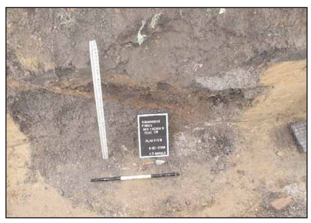
Photograph 50: Planview shot of Feature 176, a circular shaft feature showing coal ash and cinder fill. View facing west (May 2008).