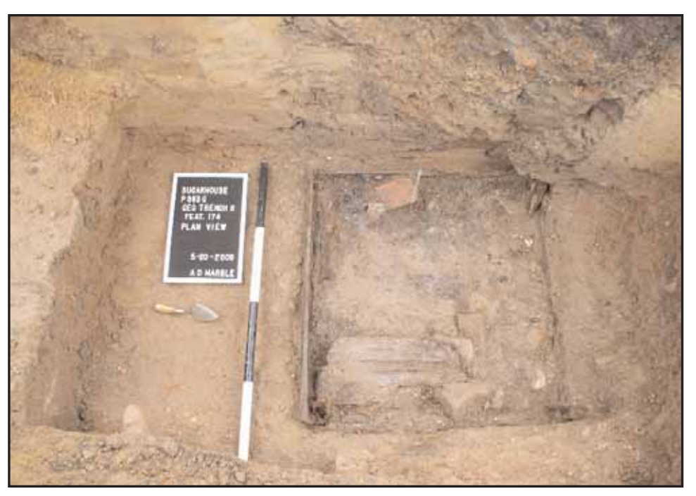
Photograph 48: Planview shot of excavated wood-lined shaft Feature 174 in GeoTrench 8, Historic Area H-2, showing typical feature fill. View facing west (May 2008).