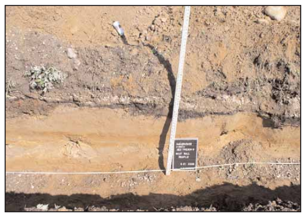
Photograph 43: Shot of west wall profile GeoTrench 9 67-74 feet showing modern fill over modern alluvium (banded sands) over Pleistocene-aged soil with cobbles. View facing west (May 2008).