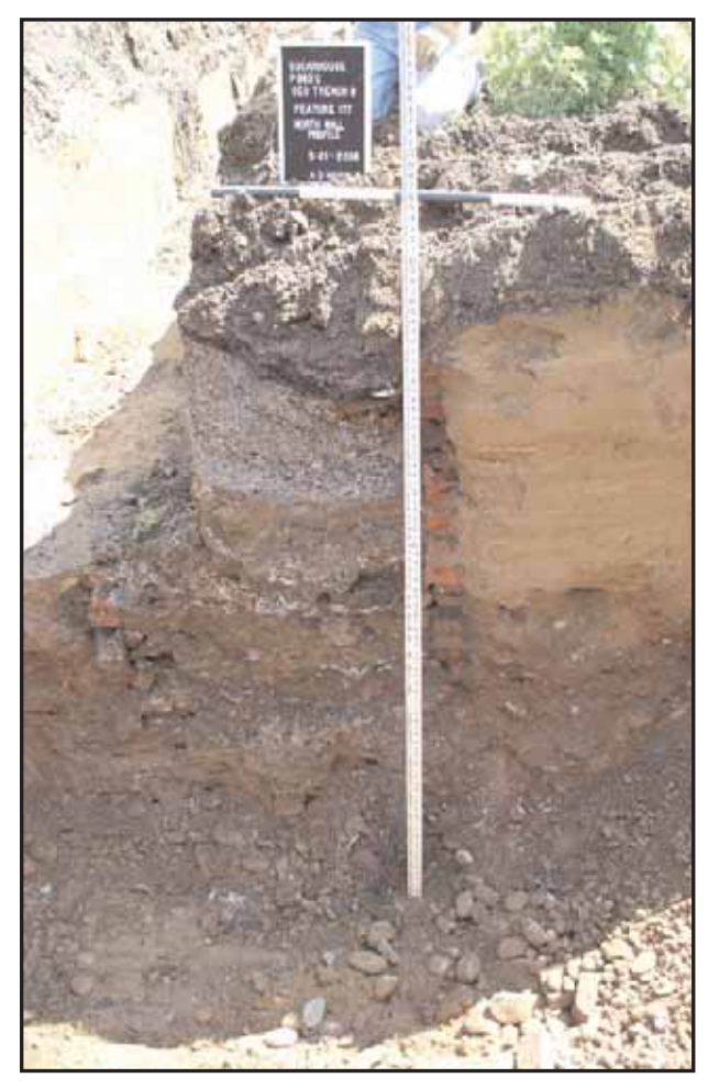
Photograph 53: Profile shot of Feature 177 in Historic Area H-2 showing layers of coal ash and ash fill throughout. View facing north (May 2008).