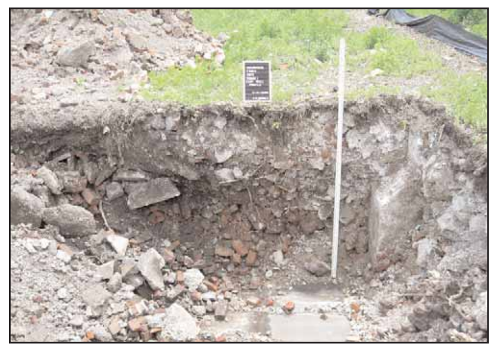
Photograph 11: Shot of east wall profile of Beach Street Power Station Trench 1 showing demolition fill, concrete pillar, and floor in Historic Area H-1. View facing east (May 2008).