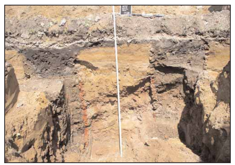
Photograph 55: Profile shot of Feature 178 (left side of photograph) and Feature 179 (right side of photograph). Note the dark soil and artifacts at the base of Feature 178. View facing west (May 2008).