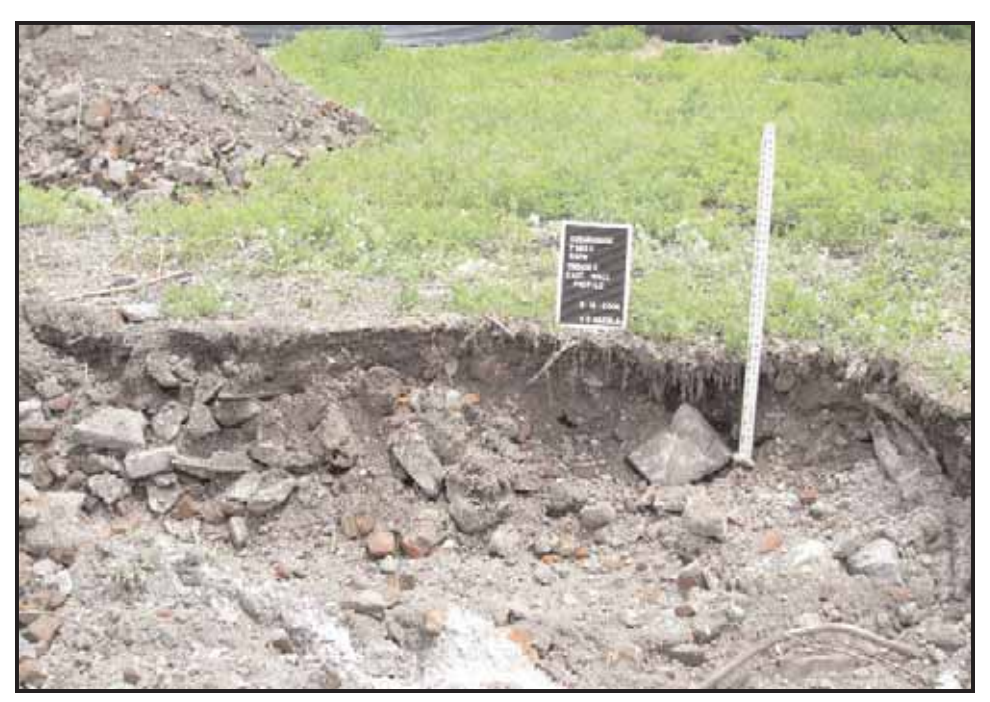
Photograph 12: Shot of east wall profile of Beach Street Power Station Trench 2 showing demolition fill and impenetrable steel reinforced concrete in Historic Area H-1. View facing east (May 2008).