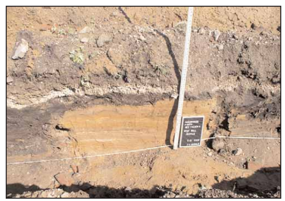
Photograph 42: Shot of west wall profile GeoTrench 9 47-52 feet showing modern fill over modern alluvium (banded sands) over Pleistocene-aged soil with cobbles and Features 178 and 179. View facing west (May 2008).