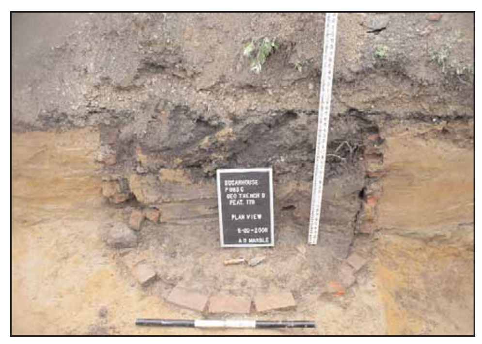
Photograph 56: Planview shot of Feature 179, a circular brick shaft feature. View facing west (May 2008).