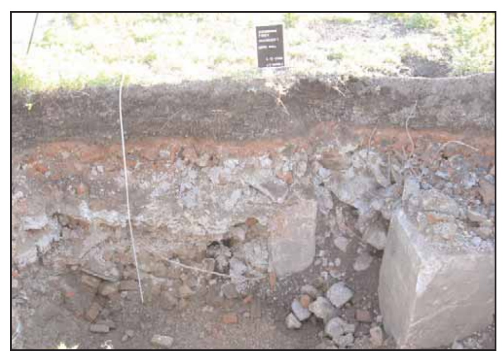
Photograph 9: North wall profile shot of GeoTrench 1 showing Beach Street Power Station rubble and foundation features. View facing north (May 2008).