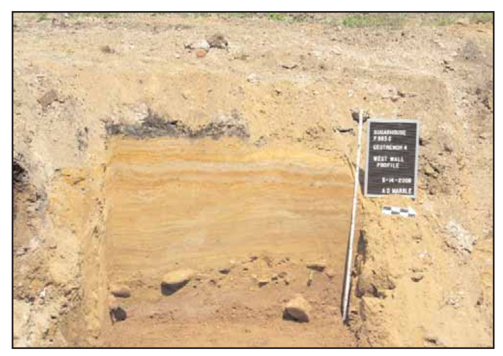
Photograph 17: West wall profile shot of GeoTrench 4 showing layers of modem fill over banded alluvium and pleistocene aged subsoil. View facing west (May 2008).