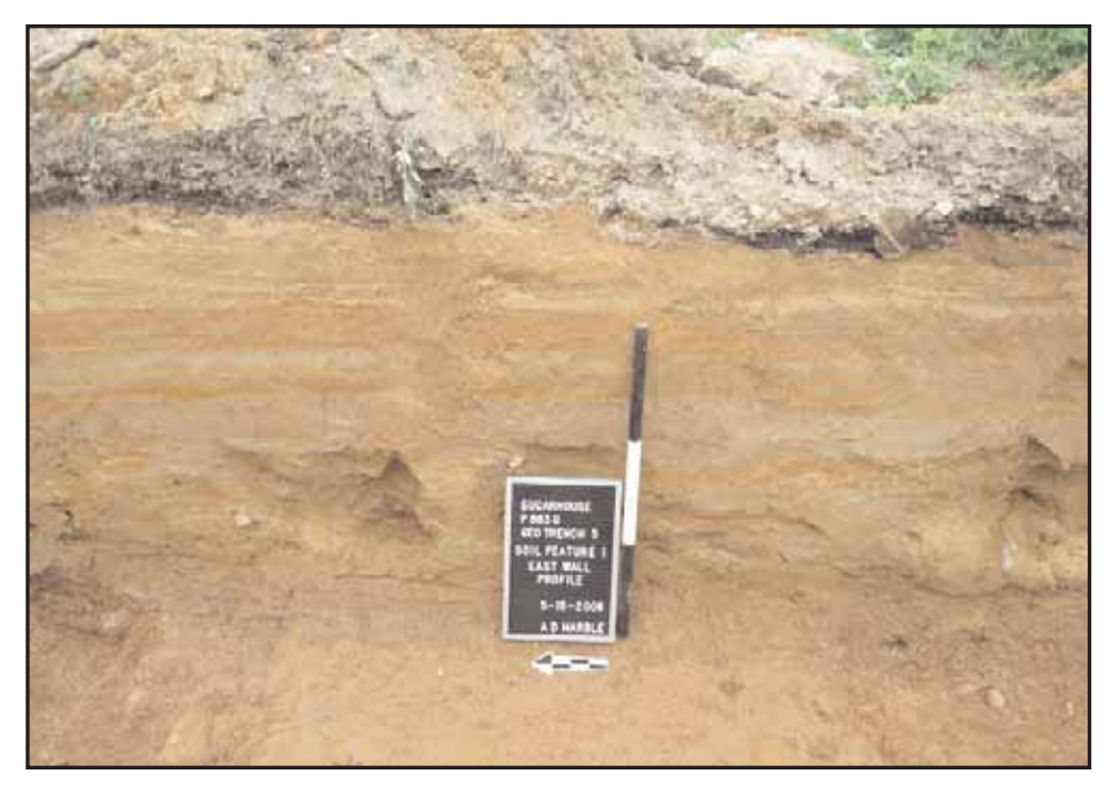
Photograph 19: Shot of east wall profile in GeoTrench 5, Feature 187, a natural soil anomaly. View facing east (May 2008).