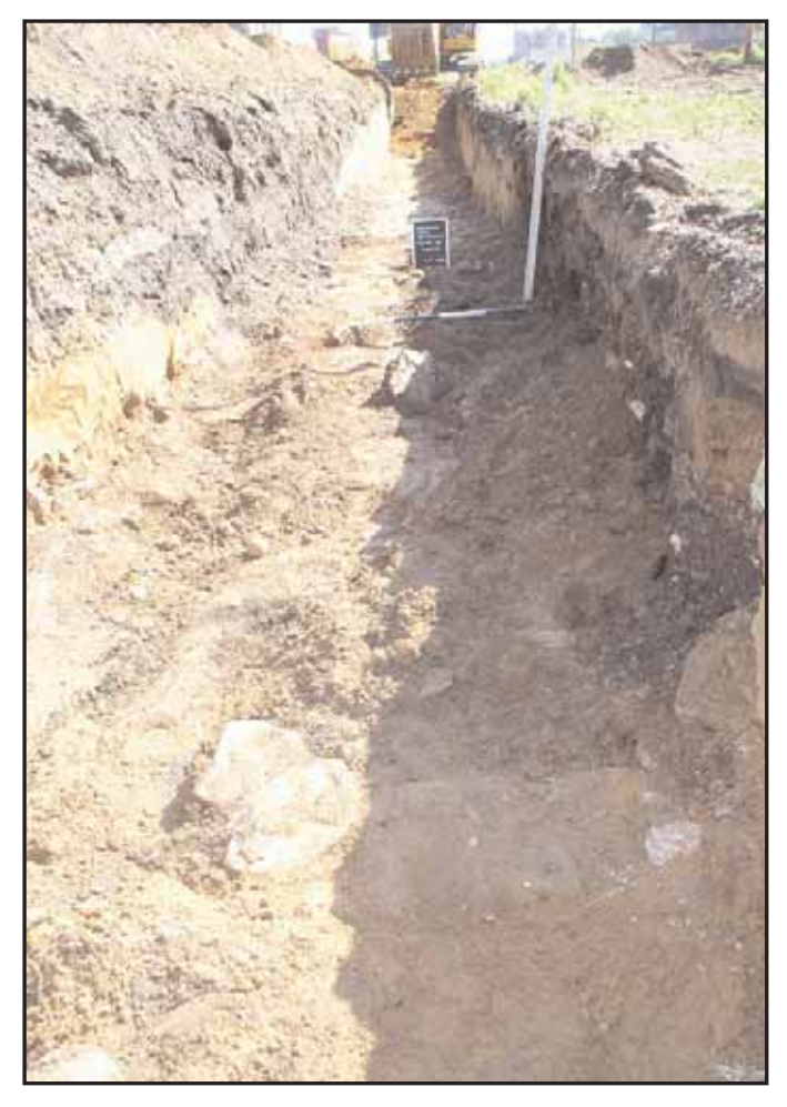
Photograph 62: Planview shot of Feature 183, a rubble and cinder-filled stone foundation located in GeoTrench 7. View facing north (May 2008).