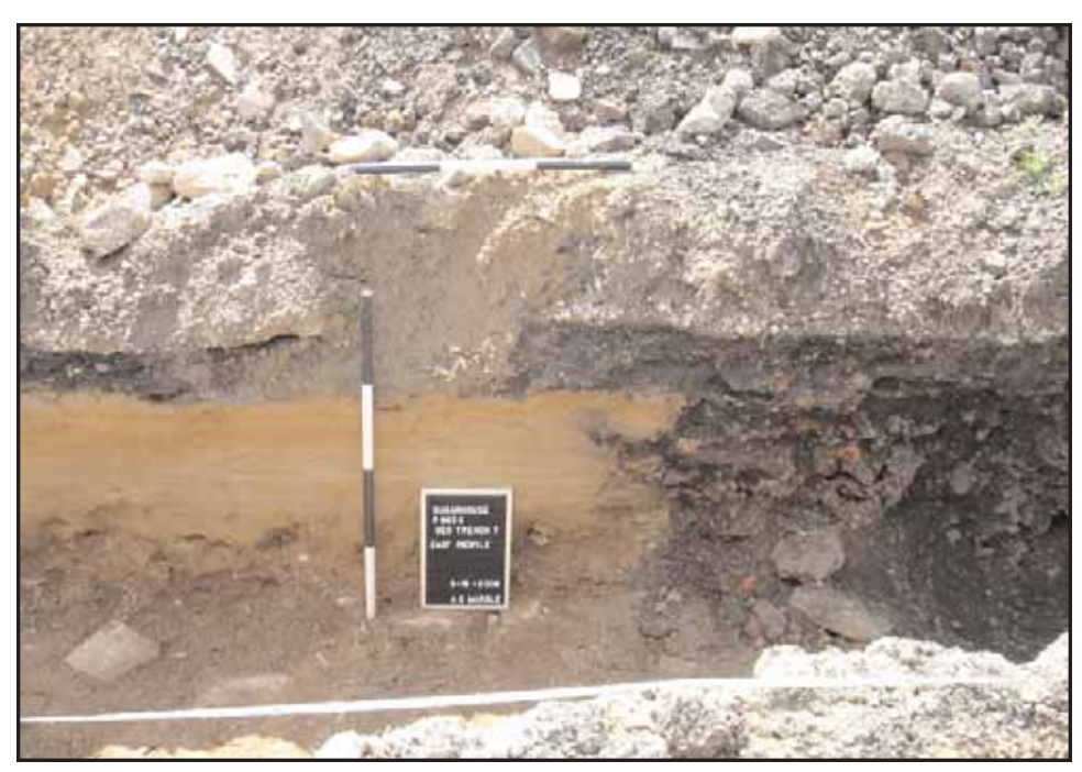
Photograph 28: Shot of east wall profile GeoTrench 7 28-36 feet showing the northern edge of Feature 183, a stone foundation filled with rubble. View facing east (May 2008).