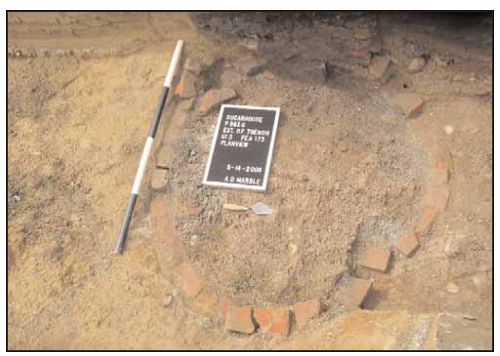
Photograph 46: Shot of planview of Feature 173 in GeoTrench 3, a brick-lined shaft feature in Historic Area H-2. View facing west (May 2008).