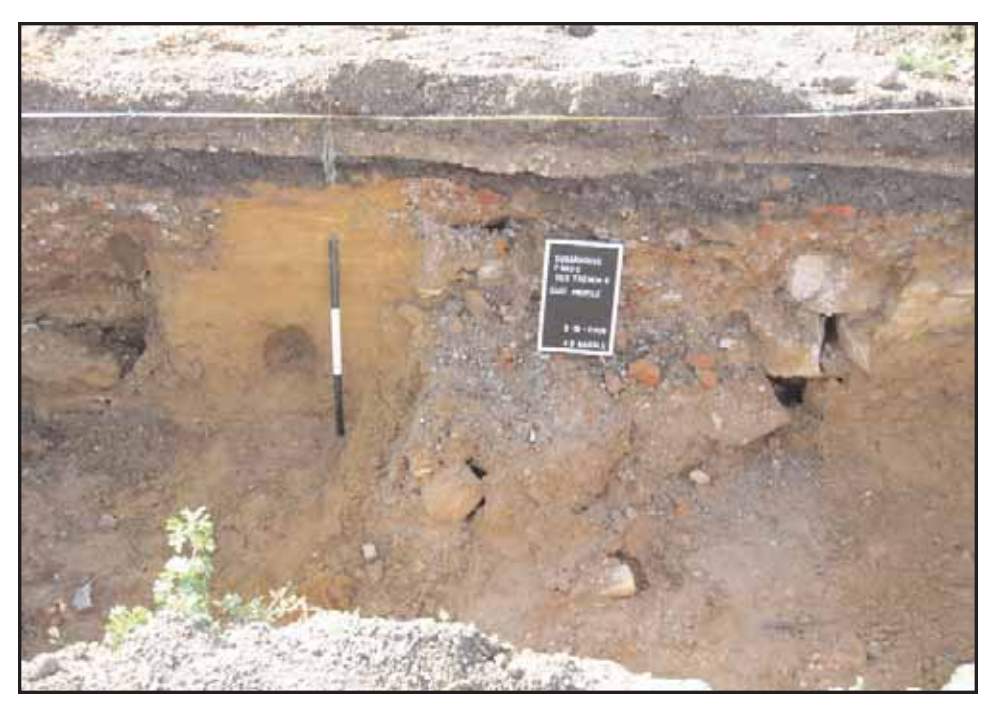
Photograph 21: Shot of east wall profile GeoTrench 6, south end 0-17 feet showing Features 175 and 183. View facing east (May 2008).