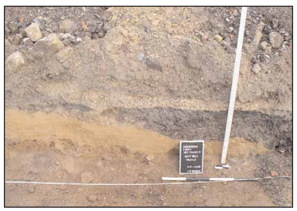
Photograph 35: Shot of west wall profile GeoTrench 8 24-31 feet showing modern fills, a remnant of Trench 5 excavated during Phase IB/II investigation (A.D. Marble & Company 2007b) over modern alluvium (banded sands) over Pleistocene-aged soil with cobbles. View facing west (May 2008).