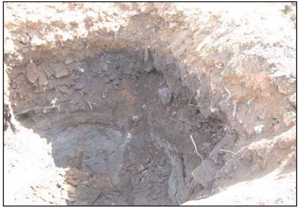
Photograph 64: Profile shot of west wall, SRT-2, showing demolition rubble and deep riverine soils. View facing west (May 2008).