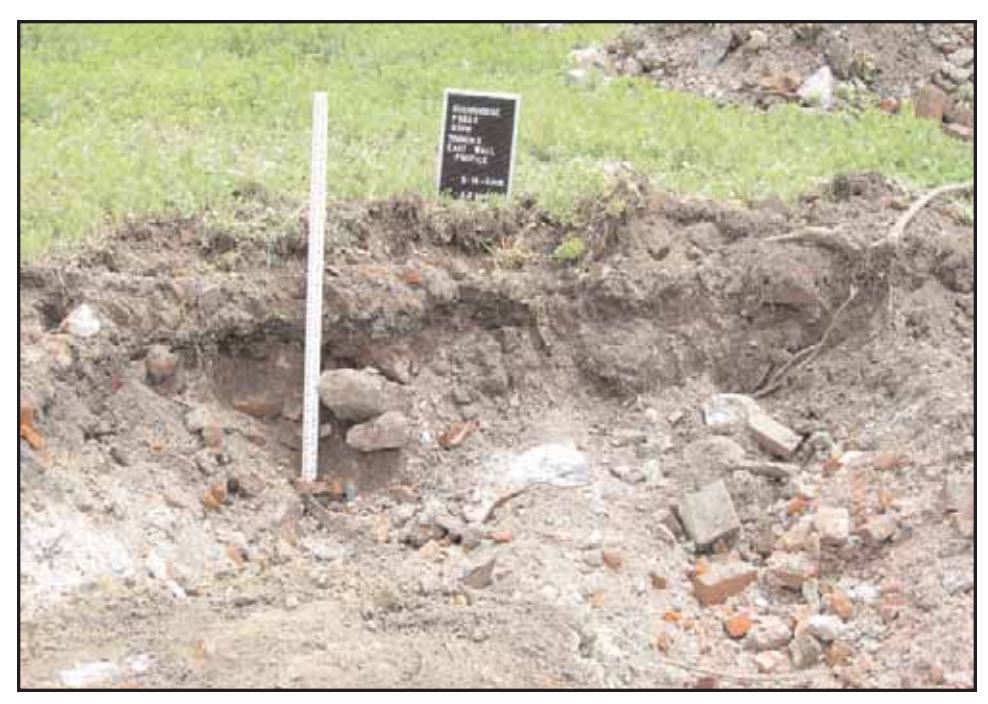
Photograph 13: Shot of east wall profile of Beach Street Power Station Trench 3 showing demolition fill and impenetrable steel reinforced concrete in Historic Area H-1. View facing east (May 2008).