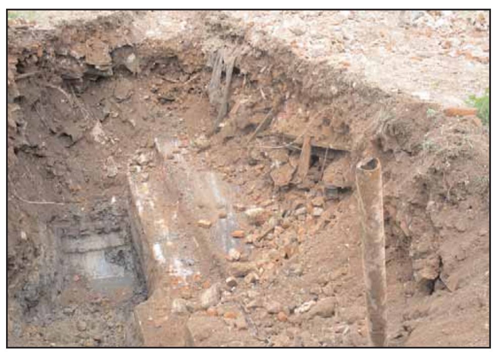
Photograph 69: Excavation shot of SRT-6 showing concrete floor and spaced concrete footers with deep riverine soils between. View facing west (May 2008).