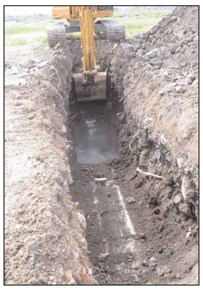
Photograph 66: Action shot of trackhoe excavating SRT-3 showing concrete floor, concrete footer, and demolition rubble associated with Sugar Refinery. View facing east (May 2008).