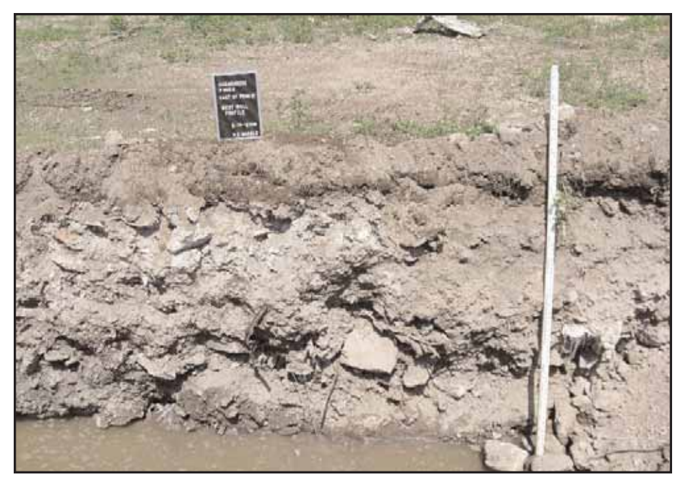
Photograph 63: Profile shot of west wall, SRT-1, showing demolition rubble and water collecting over a poured-concrete floor. View facing west (May 2008).