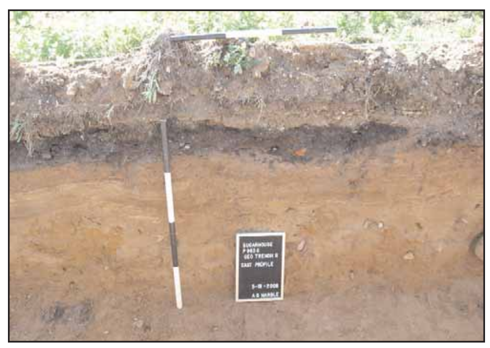
Photograph 25: Shot of east wall profile GeoTrench 6, 129-137 feet showing fill horizons over modern alluvium (banded sands) over Pleistocene-aged soils with cobble. View facing east (May 2008).