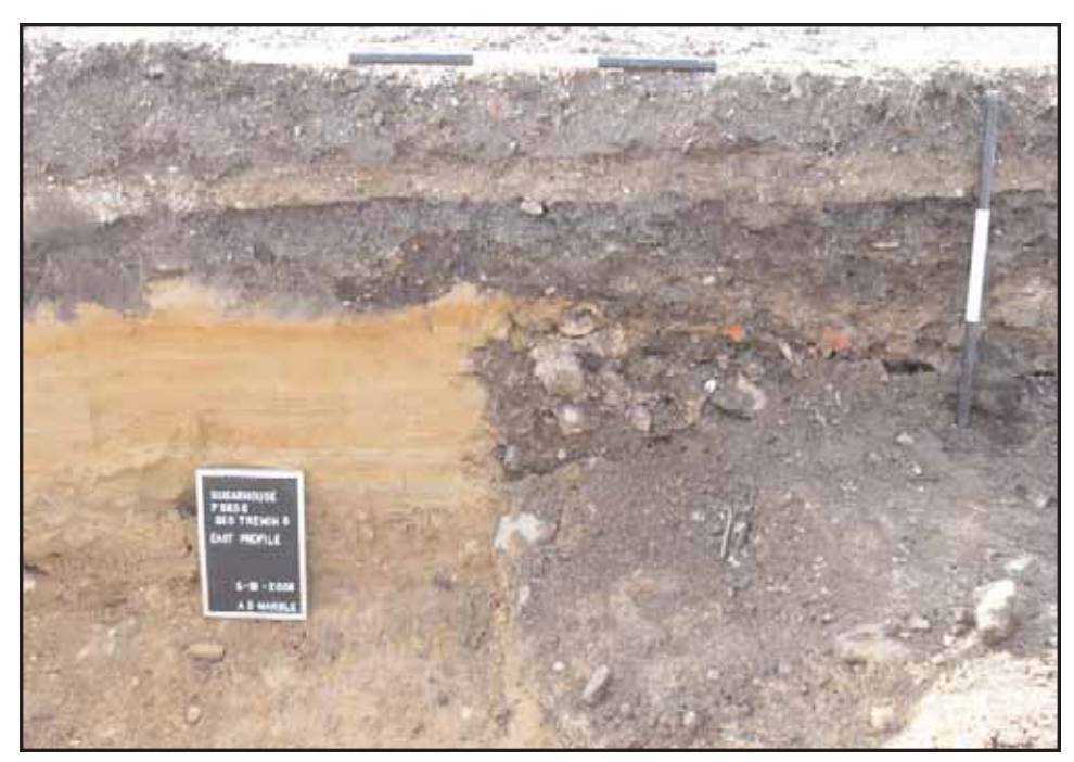
Photograph 22: Shot of east wall profile GeoTrench 6 38-46 feet showing the north edge of Feature 183. View facing east (May 2008).