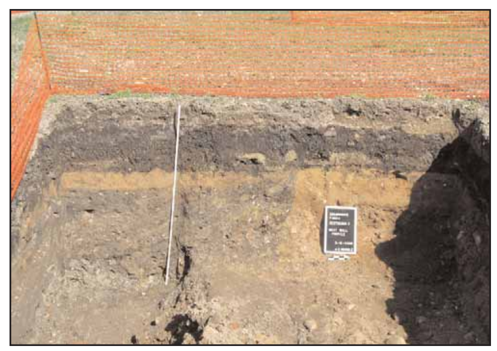
Photograph 15: West wall profile shot of GeoTrench 2 showing fills and subsurface disturbance. View facing west (May 2008).