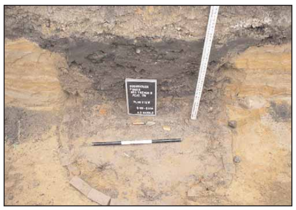
Photograph 54: Planview shot of circular brick-lined shaft Feature 178. Note the single piece of stoneware on the mechanically excavated surface. View facing west (May 2008).