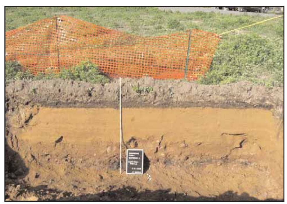
Photograph 16: South wall profile shot of GeoTrench 3 showing layers of modern fill over banded alluvium and Pleistocene-aged subsoil. View facing south (May 2008).