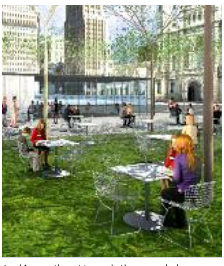
Looking northeast towards the expanded Convention Center on North Broad Street, an outdoor café will provide a place for breakfast, lunch and afternoon meetings, affording views of the Benjamin Franklin Parkway. An elevator provides a third entrance to transit and a direct link to the 15th Street subway-surface station.