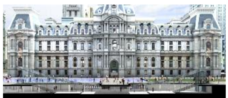
On the western side of the plaza, two glass head houses provide connections to the transit concourse below. The structures are shaped with an arcing profile so they appear to slide under the central walkway that extends the Market Street axis through City Hall Courtyard. Rising to a height of 20 feet at the top of the stairs, the pavilions are 21 feet wide and 96 feet long and frame the central portion of City Hall without obscuring the view.