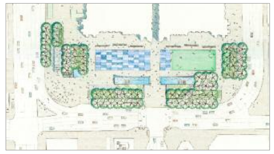
Site plan for new Dilworth Plaza: A lawn panel (130 x 60 feet), located on the southern end, gently slopes up to the south to provide easy views towards the fountain. The programmable fountain (180 x 60 feet) can be turned partially or completely off to allow for concerts, events or movies. At the northern end, adjacent to a cluster of trees and lawn, is a café. Two sloping glass headhouses provide stairways and one elevator to the transit concourse below. Curb bulb-outs at 15th and Market shorten the crossing distance and create a new legal crosswalk from the south side of Market, next to the "Clothespin," directly to Dilworth Plaza.