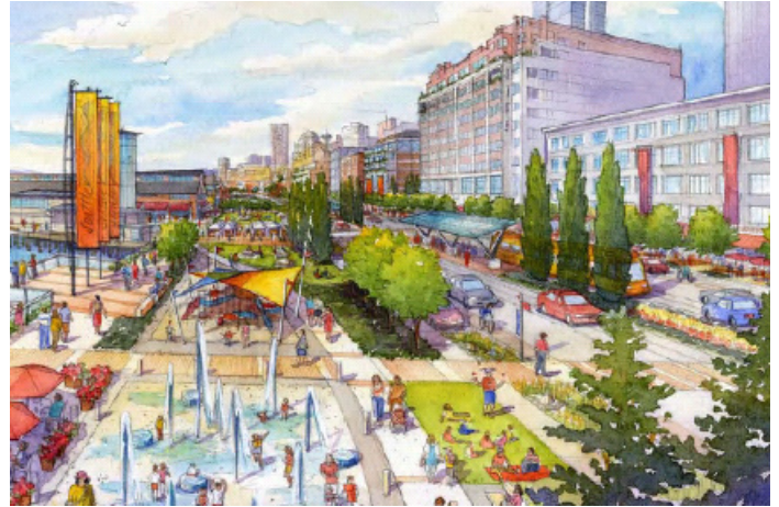
A vision can show images, but they are just examples, not the only possible uses. (Seattle)

Visions are typically organized by broad themes, within which there are examples of how different models can look in reality. For example, the painting on the right shows one idea from a Seattle waterfront vision plan that features numerous images that embody the ideals of the vision. In a vision, paintings with differing uses can be shown -- this flexibility and room for creativity can make visions more effective than prescriptive city master plans.