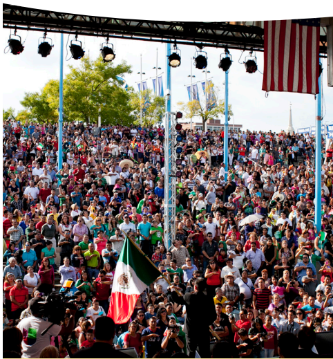
2013 Mexican Independence Day as part of the PECO Multicultural Series