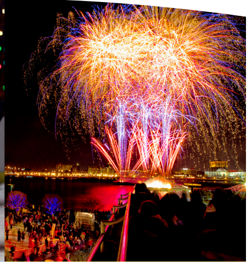
New Year's Eve on the Delaware River Waterfront