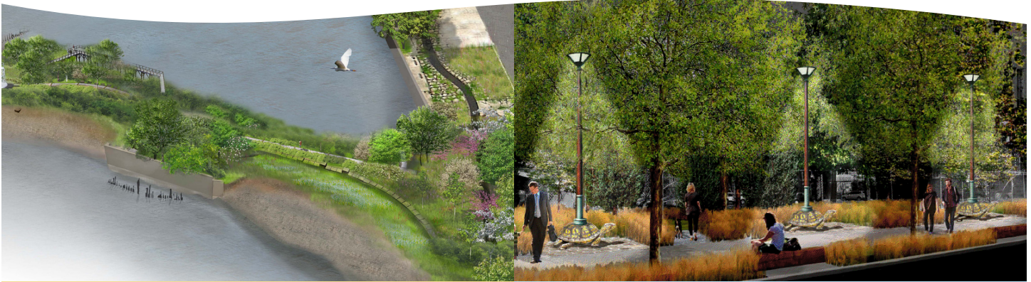
Applied Ecological Services, Rendering of Pier 53