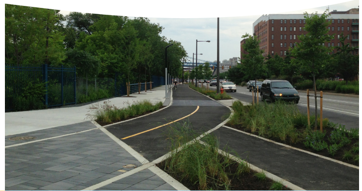
Delaware River Trail Northern Segment

DELAWARE RIVER TRAIL In June 2013, DRWC opened the first permanent segment of the Delaware River Trail from Spring Garden Street to Ellen Street. The divided, multi-modal trail serves as a prototype for future trail development including the northern extension across the SugarHouse Casino property to be completed in 2014. In 2013, DRWC also initiated a full final design of the trail from the PECO station in Fishtown to Pier 70 in Pennsport through a contract with RBA Associates, the firm that designed the Hudson River greenway in Manhattan.